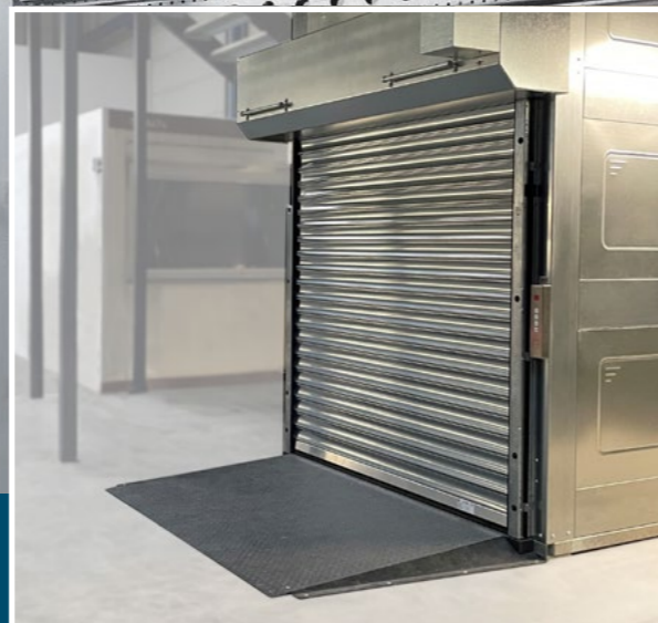
SHERPA® with roll shutter doors